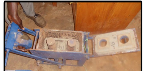
Ugandan manual brick machine

Also in Uganda, we have been looking for potential building materials to prepare for construction. We have found some manual brick-making machines that offer a double compaction to blocks, while still giving the opportunity of holes for rebar.