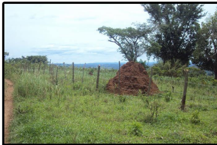
Fencing around the property

After the completion of the survey of the land, there are 83 acres belonging to F2F (instead of the original 100 acres). The former land owner was gracious and honest to change the asking price to a lower number, to not include those 17 missing acres. Praise God for this man's integrity!